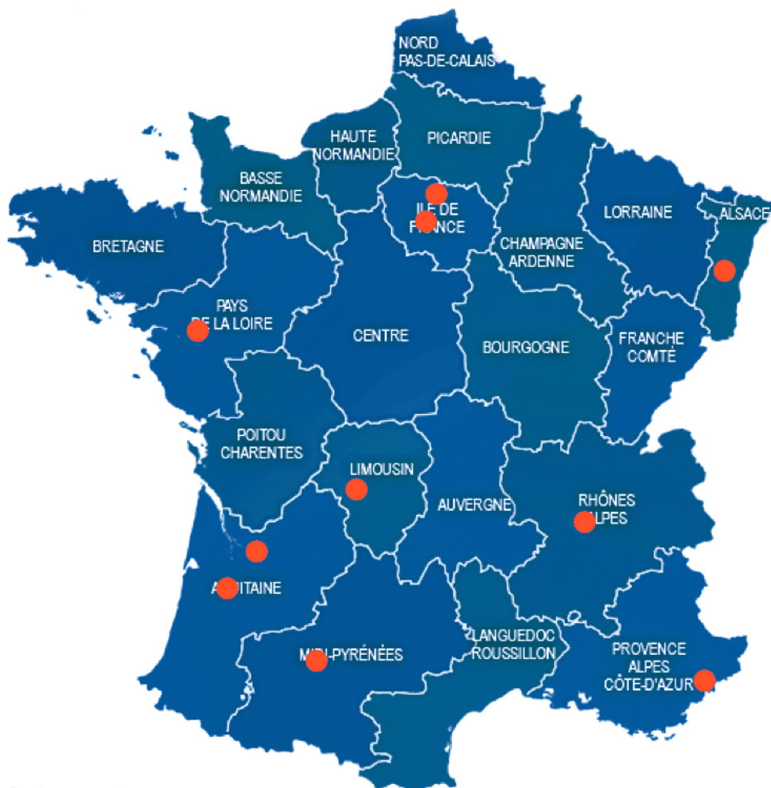
Fig. 1. Geographical distribution of centers surveyed on their outpatient plastic and reconstructive surgery practice in 2014.